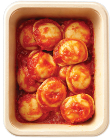
Choose an entrée